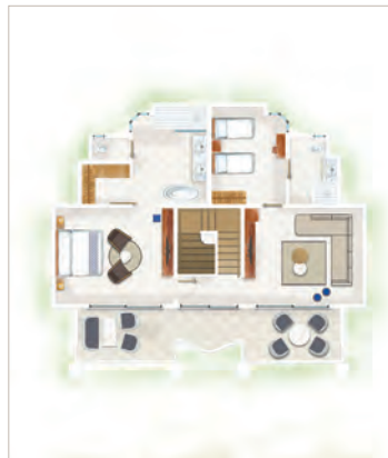
Paradis Luxury Family Suite Beachfront