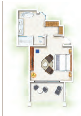
Paradis Beachfront / 2-bedroom Paradis Family Suite Beachfront (interleading)