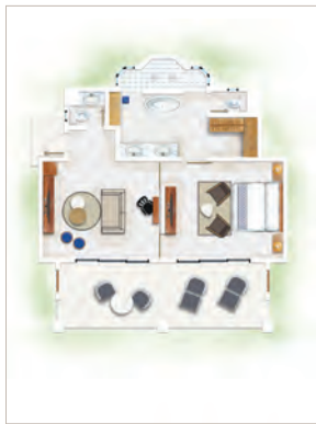
Paradis Suite Beachfront