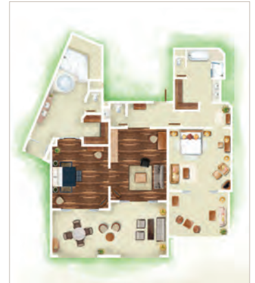
2-bedroom Senior Family Suite Beachfront