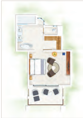
Paradis Bay View