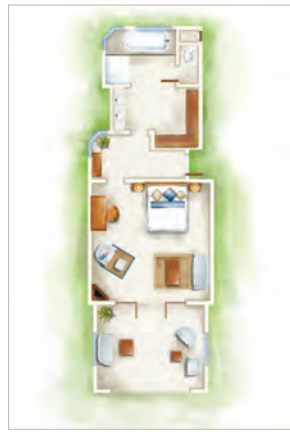
Junior Suite / Junior Suite Beachfront / 2-bedroom Family Suite Beachfront (interleading)