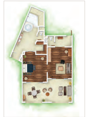
Senior Suite Beachfront