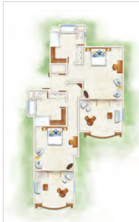
2-bedroom family suite