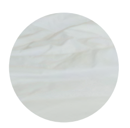
BED LINENS made of 100% Egyptian cotton with sateen finish.