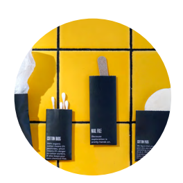
DRY AMENITIES packed in stone paper.