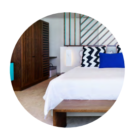
CARPE DIEM BED hand-crafted in Sweden in collaboration with acclaimed physiotherapists.