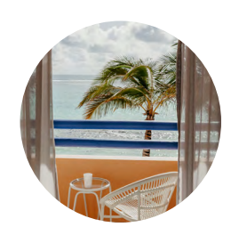
A BALCONY with VIEWS.