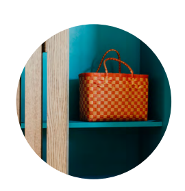
BEACH BASKETS HANDWOVEN in Mauritius using recycled plastic.