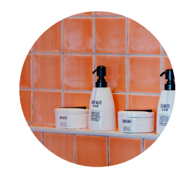
A selection of LOCALLY MADE TOILETRIES in refillable containers.