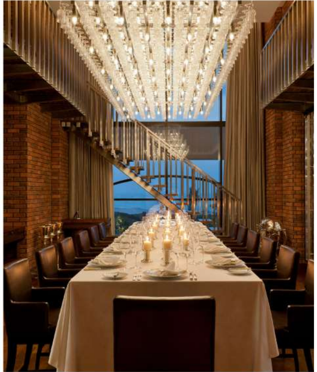
THE LOFT – AN EXCLUSIVE WINE CELLAR