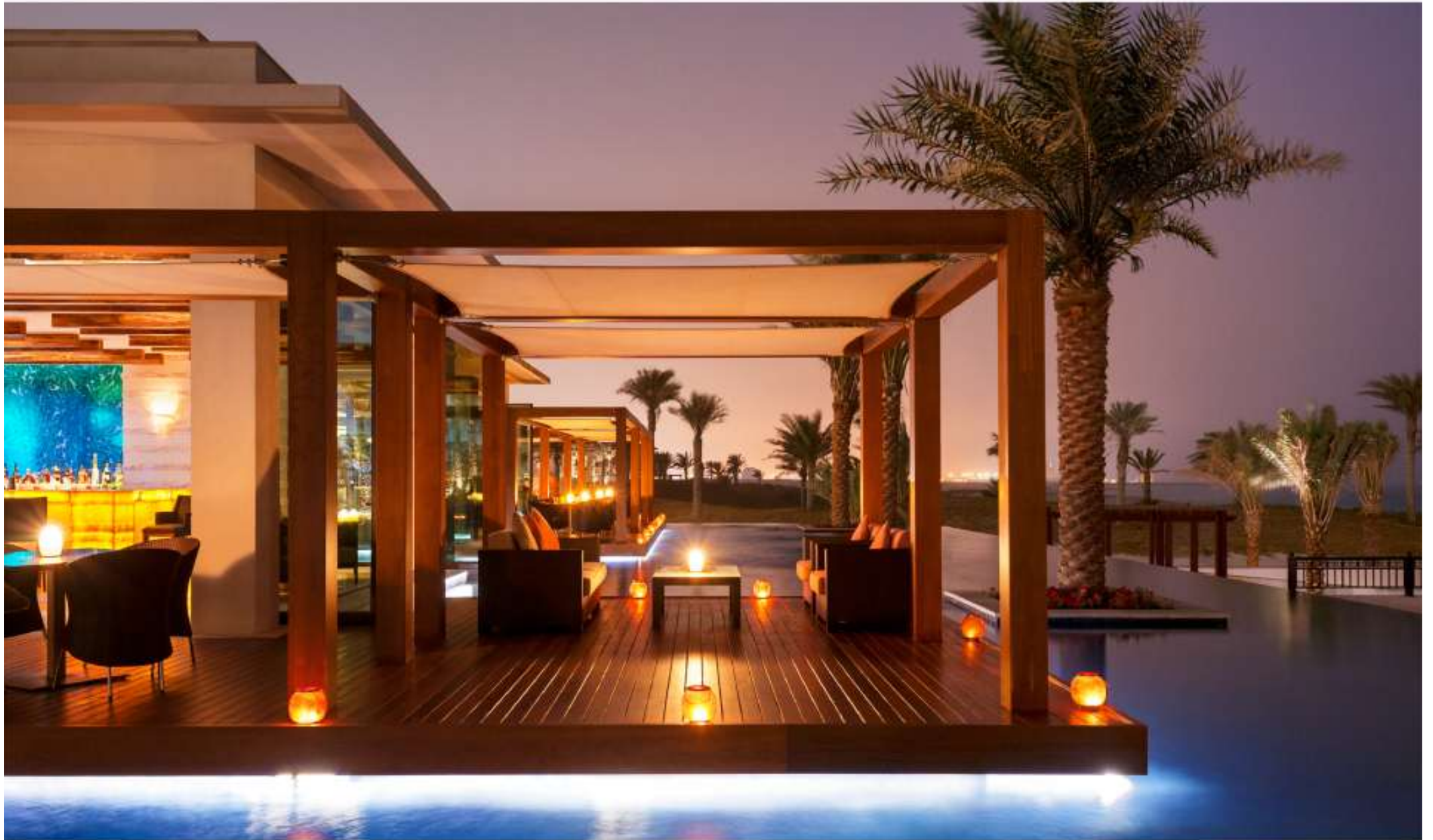
SOUTHEAST ASIAN RESTAURANT