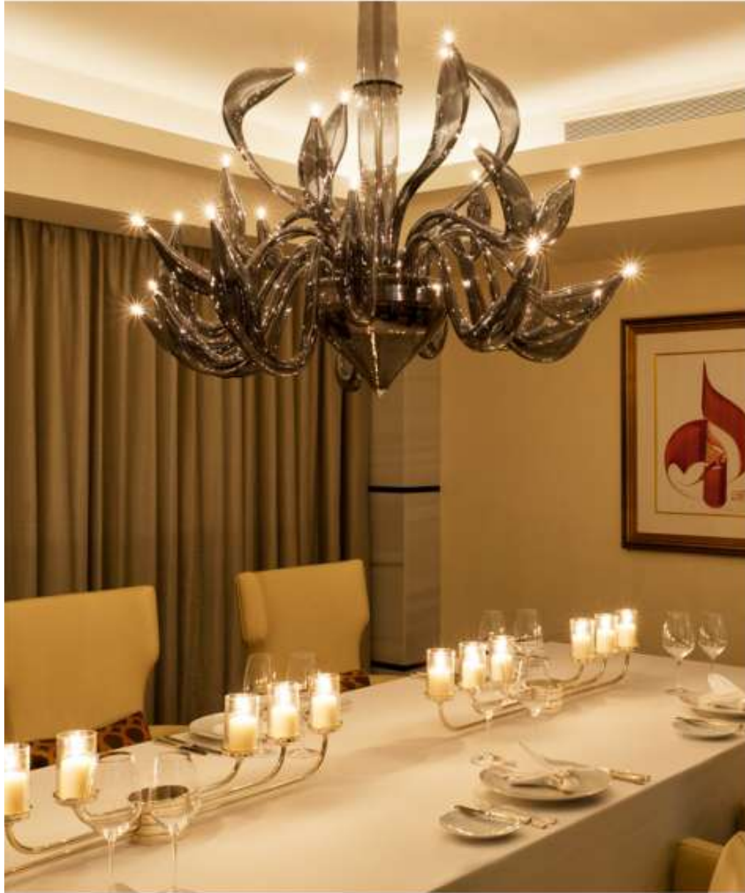
PRIVATE DINING AREA