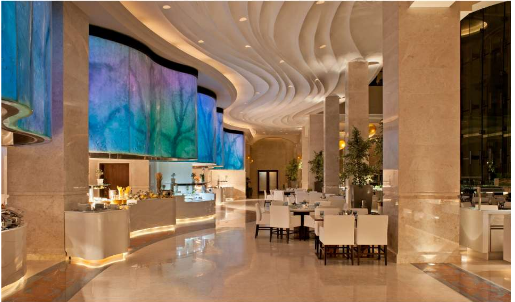
ALL DAY DINING