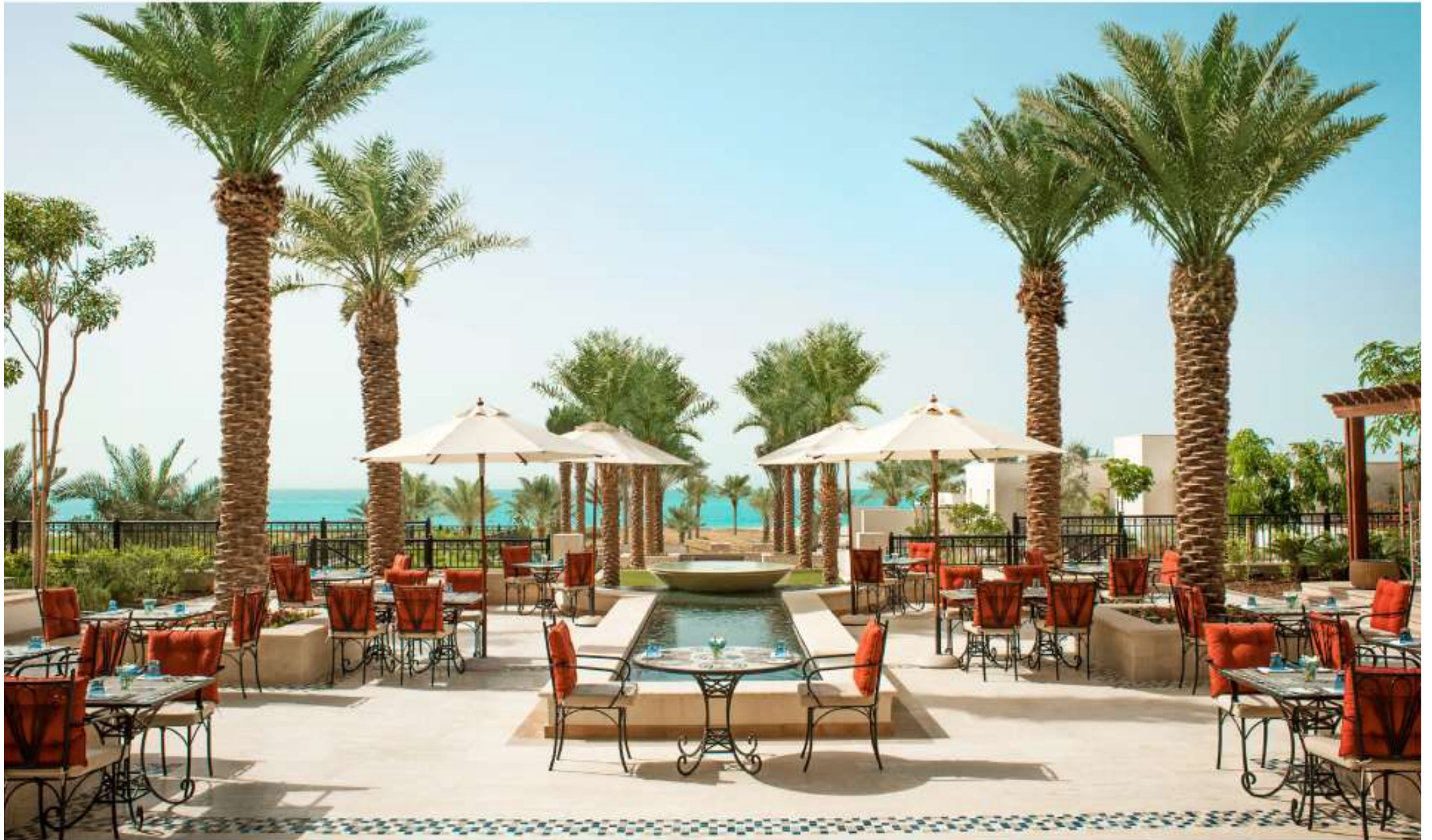
ALL DAY DINING