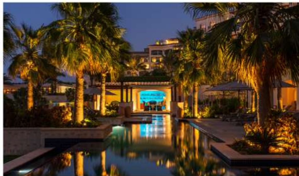
EXCLUSIVE ADULT AND LAP POOLS