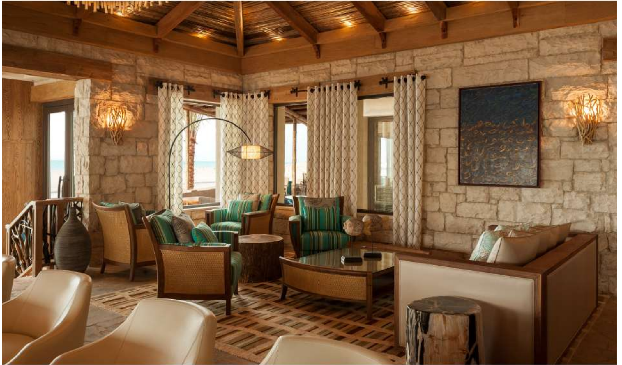
BEACH RESTAURANT AND LOUNGE