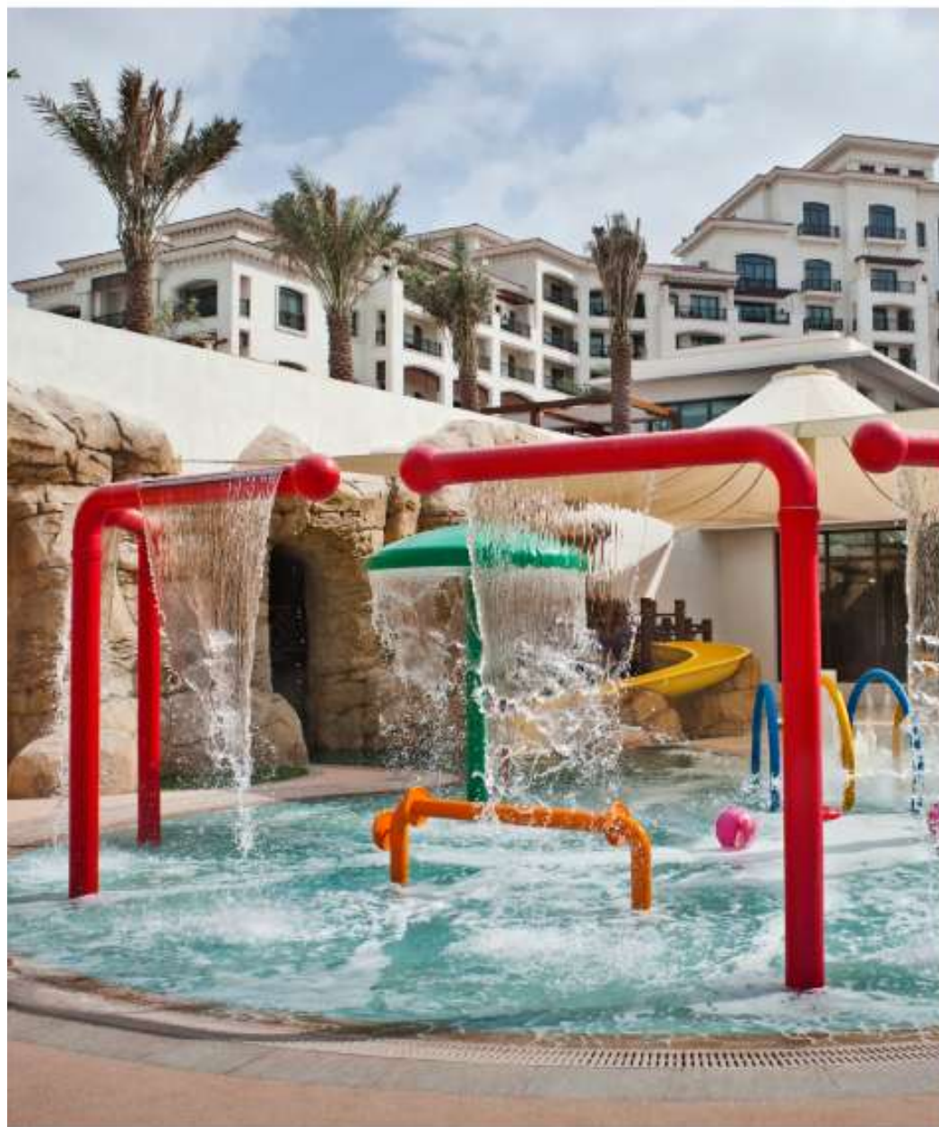
EXCLUSIVE CHILDREN'S POOL