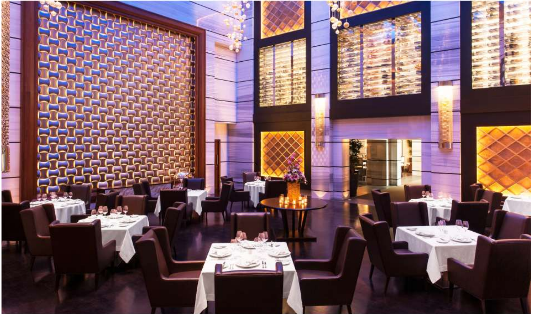
GRILL & LOUNGE