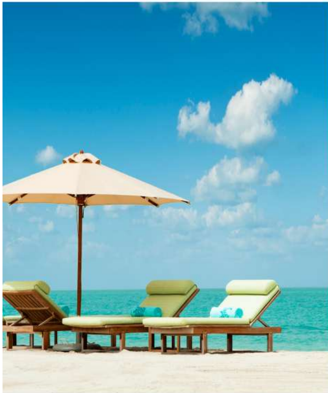
NINE KMS OF PRISTINE BEACH