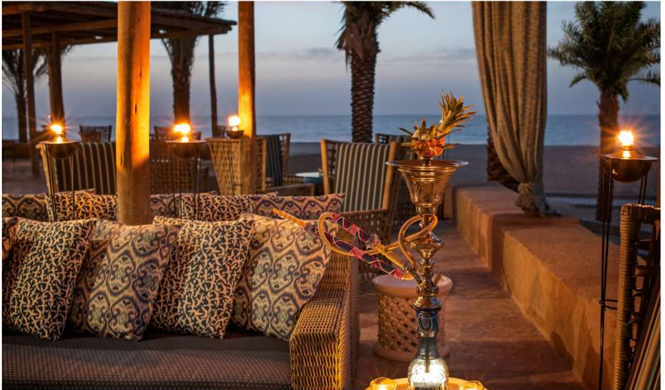
BEACH RESTAURANT AND LOUNGE