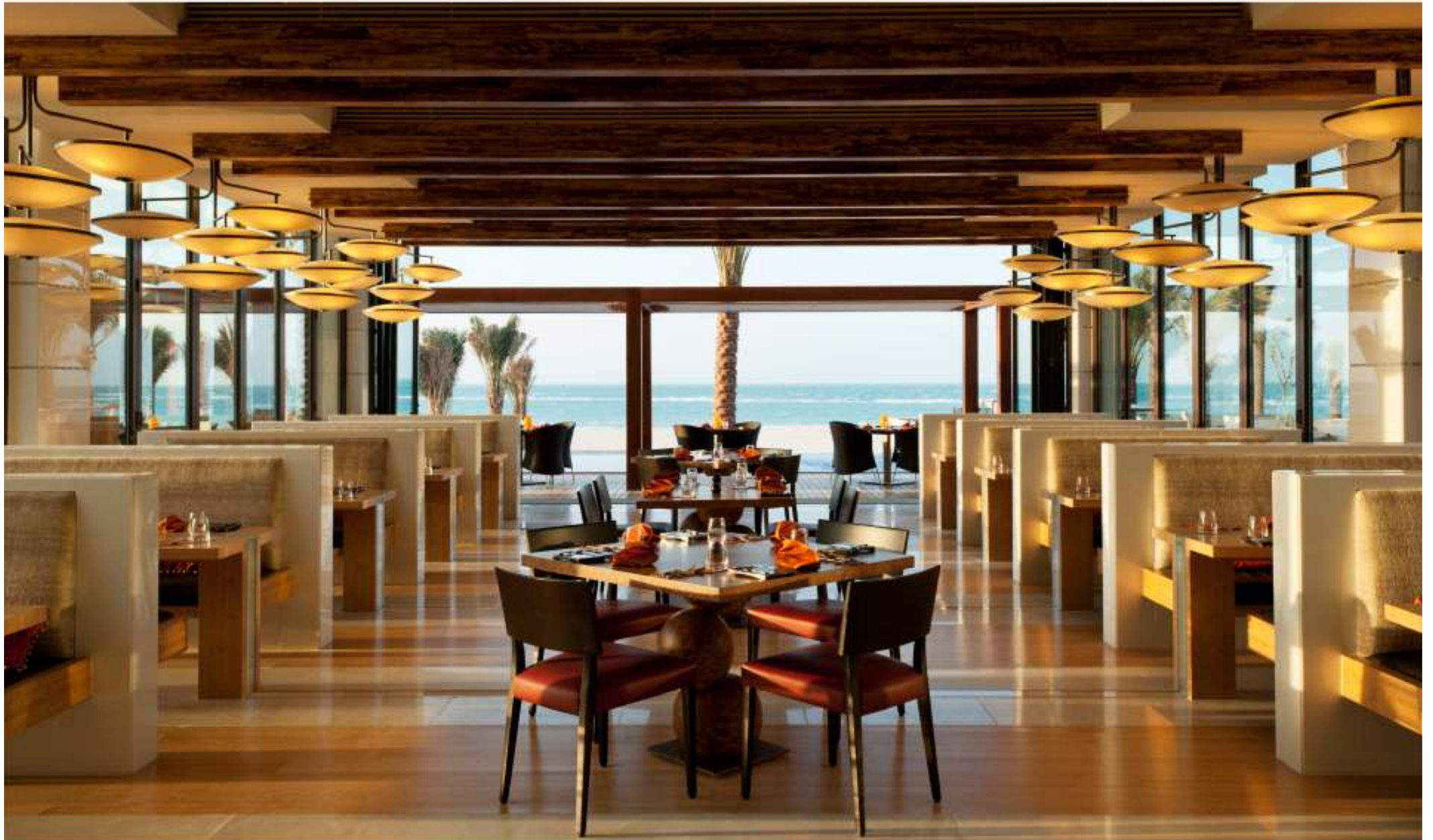
SOUTHEAST ASIAN RESTAURANT