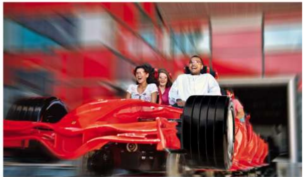
SHEIKH ZAYED GRAND MOSQUE AND FERRARI WORLD