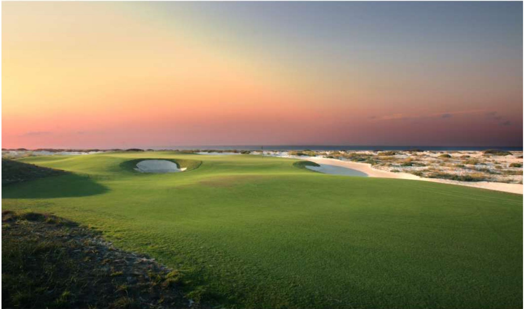
FRAMED BY 18-HOLE GOLF COURSE